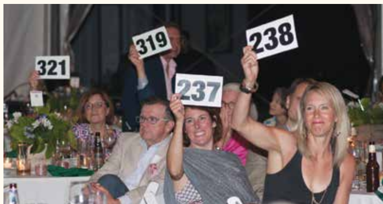
Guests supporting Fund-a-Need