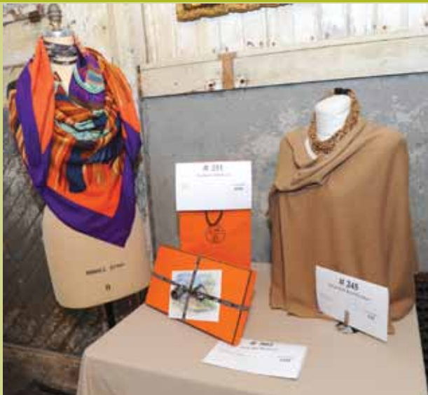
Hermès cashmere and silk scarf donated by CUFFS Cashmere poncho donated by ACCENTS

Moving, downsizing or simply changing your home's décor? Please keep Hopewell in mind as we prepare for next year's Summer Solstice auction! Your donations will help continue the tradition of our unique auction at our annual benefit. Your donation is 100% tax-deductible. All proceeds from our auction support Hopewell's mission as a residential therapeutic farm community for adults with mental illness.